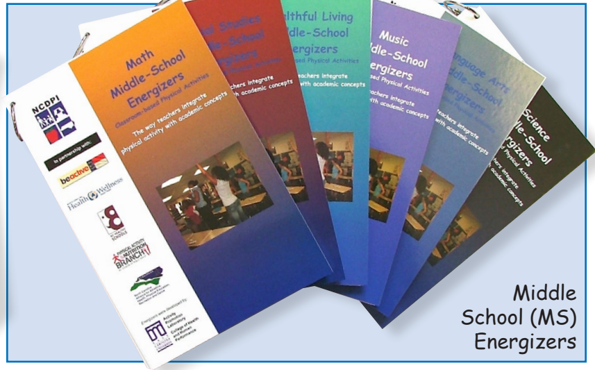
Middle School (MS) Energizers

Call for Discount Pricing if ordering more than 20 booklets!